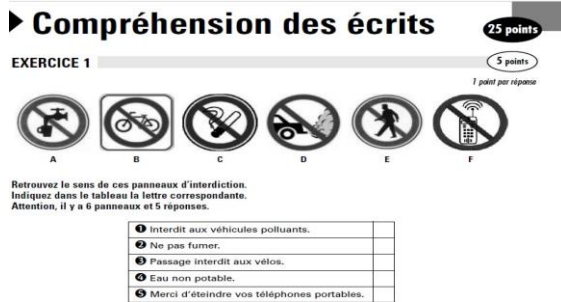
Figure 3. form of items