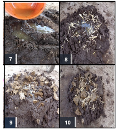
Figure 2. Mixtures with the different organic stabilizers