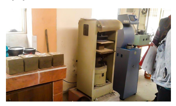
Figure 1. Standardized adobe samples for the test in the compression machine.

In Figure 2, we present photographs of the different mixtures proposed for this study. The photograph 1 shows activated mud without stabilizers, photographs 2 and 3 show activated mud with straw and cow manure respectively. Photographs 4 to 10 show the mixtures of resting mud with the different stabilizers in the proportions stablished in the Table 1.