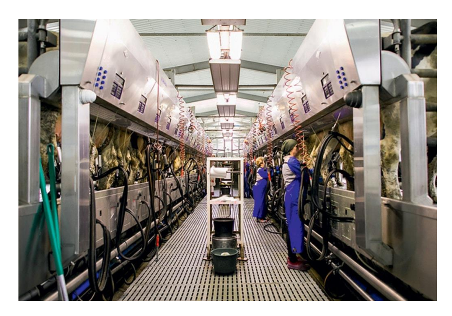
Figure 3. Milking parlor of the dairy complex LLC "Agrofirma" Village named after G.V. Kaishev"

Comfortable conditions have been created for milking cows: from the equipment of the milking parlor and the primary processing of milk from De Laval and high hygiene standards to the sounds of classical music that improve the milk flow process (figure 3).