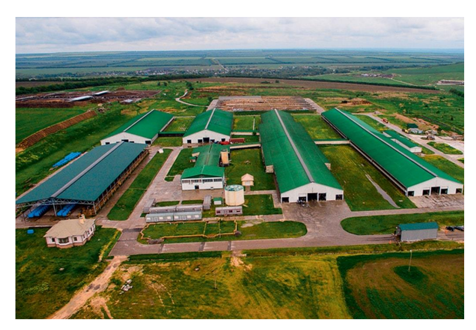
Figure 1. The territory of the complex of LLC Agrofirma" Village named after G. V. Kaishev"

The feeding is the same type all year round using homogenized feed mixtures. Diets are balanced in nutritional value and energy value. Distribution of feed is carried out using self-propelled mixer-feeders "SILOKING" (Germany) and "KUHN" (France), thanks to which effective management of feed stocks is carried out. An electronic weighing system, included as standard, ensures accurate control of the amount of food ingredients loaded and dispensed. At the same time, cows have free access to clean drinking water around the clock.