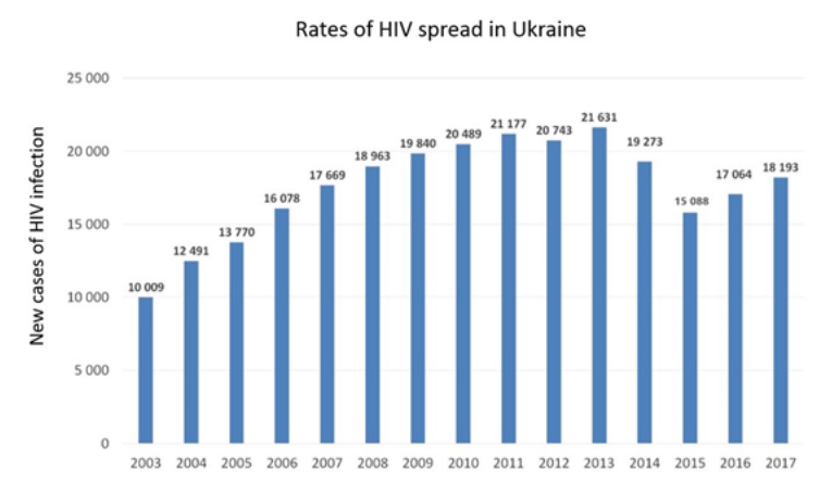
Figure 1: HIV prevalence in Ukraine (developed on the basis of "AIDS in Ukraine: Statistics", 2019)

Therefore, at the present stage, it is important to create and formulate the legal aspects of HIV/AIDS. The most important of these include the validity of a total, and therefore forced, population survey on HIV/AIDS, based on the results of which epidemiologists could make a correct idea about the properties and prospects of the epidemic, as well as plan measures to block its spread. Ukraine's use of strict imperative measures of regulation is conditioned primarily by the rate of HIV spread in the country (Fig. 1).