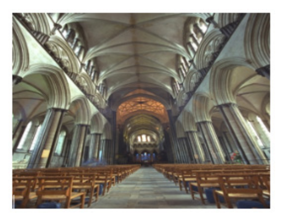
Figure No. (2) shows the movement suggested by the sequence of columns in the Church / Source No. (16).

of his personality so that its primary goal is to properly guide the recipient in his relationship and interaction with space with the intention of achieving his own harmony within the space environment, even if to a certain degree.