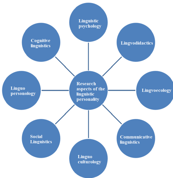
Figure 1: Branches that consider the concept of linguistic personality in linguistics as an object of research

Anthropocentric research of the language, special emphasis on the human factor in the language increases the number of subjects that are considered linguistic personality. Aspects of the study of linguistic personality can be systematically shown in the form of diagrams (Figure 1).