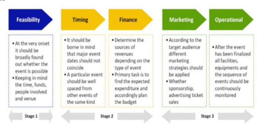
Figure 3: Steps of Event Management Planning

5. Budget management and expert planning lead to ensure the event success