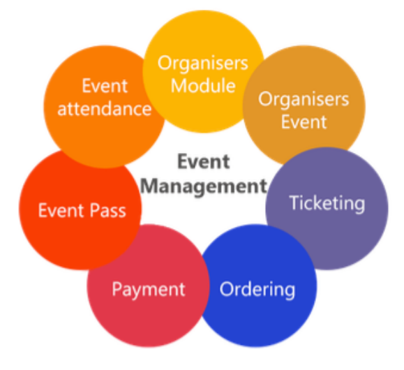
Figure 2: Event Management aspect

Creating an event simply start with ap plan, theme or a goal. From starting the event it should have a clear purpose which will drive speakers, venue and contents. For set up the basics it need to develop an attarctive website, that defined the event propely. After that it can set the payment so for event the attendees can pay conviniently.