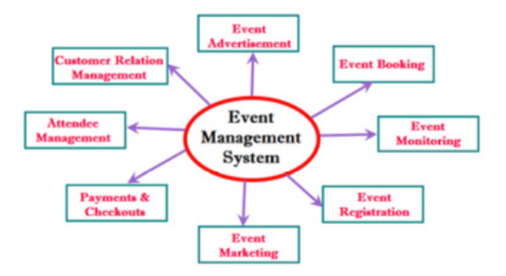
Figure 1: Event Management system

For developing and creating large scale events like weddings, festivals, concerts, conventions, ceremonies, formal parties, conferences it can consider event management as an application of project management. Before actually launching the event it include identification of target audience, coordinating the technical aspects, study of brand and devising the concept of event [1]. From business breakfast meetings to organize the Olympics now included in industry of event management. In order to celebrate achievement, market themselves, raise money or build business relationships many charitable organizations, industries and groups hold the events.