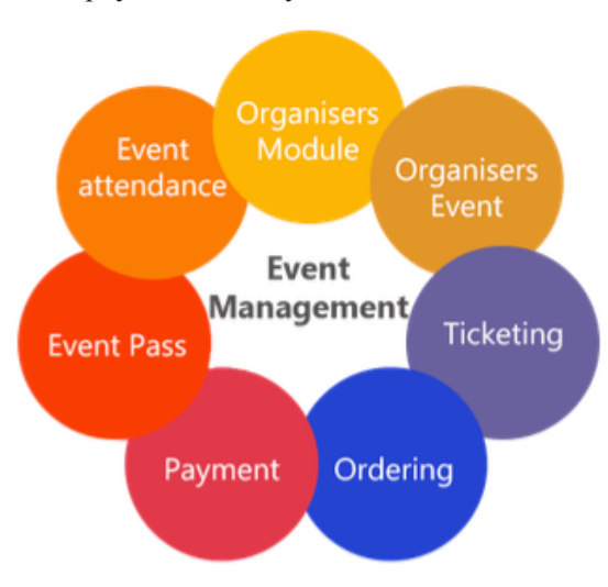
Figure 2: Event Management aspect

Creating an event simply start with ap plan, theme or a goal. From starting the event it should have a clear purpose which will drive speakers, venue and contents. For set up the basics it need to develop an attarctive website, that defined the event propely. After that it can set the payment so for event the attendees can pay conviniently.