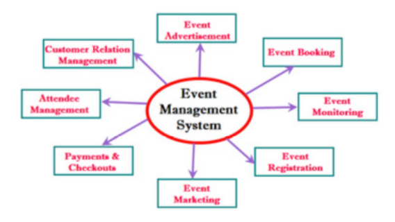
Figure 1: Event Management system

For developing and creating large scale events like weddings, festivals, concerts, conventions, ceremonies, formal parties, conferences it can consider event management as an application of project management. Before actually launching the event it include identification of target audience, coordinating the technical aspects, study of brand and devising the concept of event [1]. From business breakfast meetings to organize the Olympics now included in industry of event management. In order to celebrate achievement, market themselves, raise money or build business relationships many charitable organizations, industries and groups hold the events.