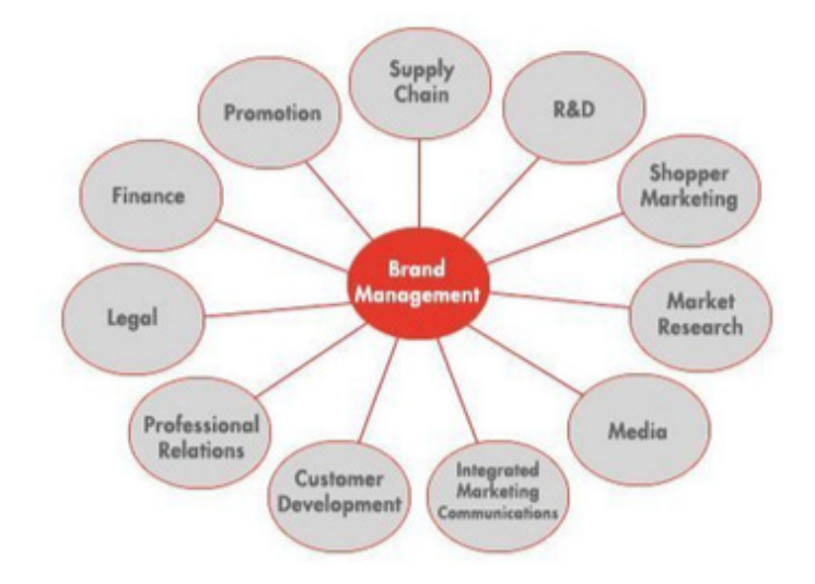
Figure 2: Factors of Brand Management

Brand loyalty alludes to how reliably the clients and devotees draw in with and buy from brand. While the showcasing can't really impact this, the client care office can — concentrating on fulfillment and relationship-building can bring clients back on numerous occasions. Brand loyalty is significant in light of the fact that it makes brand envoys that do marketing.