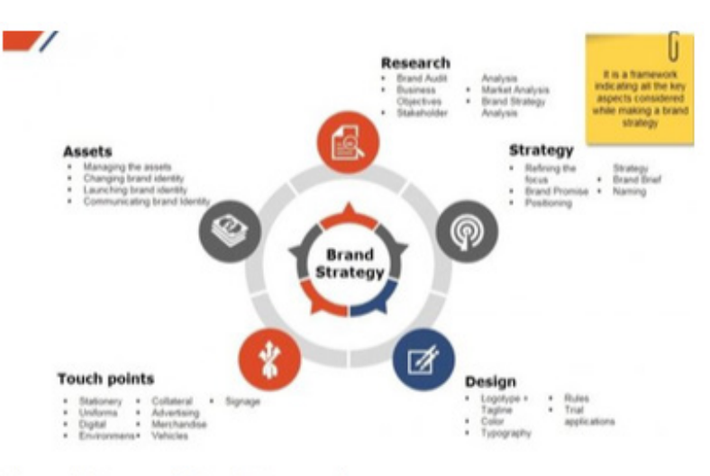
Figure 4: Strategy of Brand Framework