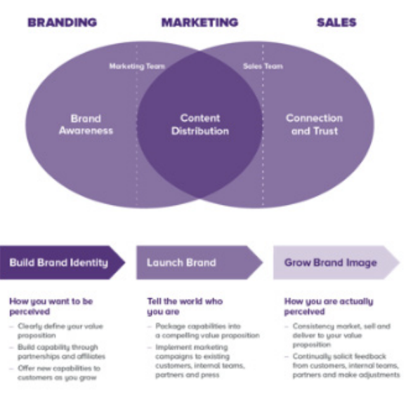
Figure 1: Relation of branding, marketing and sales