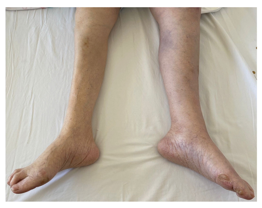
Fig. 1. Significant increase in the diameter and evanotic areas in patches in the left lower extremity.

Urgent blood test results were found as follows: white blood cell 10,720/mm<sup>3</sup> (normal range <10,000), lymphocyte 680/mm<sup>3</sup> (normal range 800-4,000), eosinophil 10/mm<sup>3</sup> (normal range 20-50), platelet 84,000/mm<sup>3</sup> (normal range 100,000-400,000), hemoglobin 9.5 g/dL (normal range 12-16), D-dimer value 0.92 mg/L (normal range 0-0.55), prothrombin time 12.4 seconds (normal range 10.5-14.5), activated partial thromboplastin time 21.6 seconds (normal range 21.6-35), and international normalized ratio 1.11 (normal range 0.8-1.2). Other biochemical parameters were found normal. A computed tomography angiogram (CTA) taken on the patient revealed an intraluminal thrombus extending from the distal part of the left superficial femoral artery to the tibioperoneal trunk (Figs. 2a, 2b). In addition, calibration increases were observed in the main and superficial femoral veins (Fig. 2c). Acute deep venous thrombosis (DVT) extending from the popliteal vein to the external iliac vein was determined by venous Doppler ultrasound.