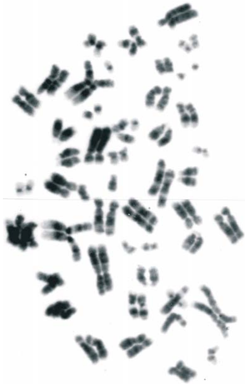
Fig. 1. Karyotype with endoduplication: end 46,XX.

The exact nonparametric Mann-Whitney test showed that in A, both total number and normal metaphase cells were significantly higher than in B ( p=0.043 and p=0.028 , respectively). The frequency of abnormal metaphase cells in B was almost significantly higher than in A ( p=0.139 ) (Table II).