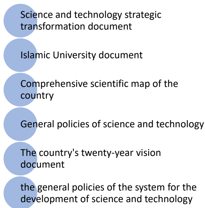
Figure 1. Two scenarios

In this step, two to three desired scenarios are selected through the environmental scanning method to present a model of the role of higher education (universities) in future employment development and the case study is Comprehensive University of Applied Sciences. Therefore, by examining the scenarios related to the future of the universities, two scenarios of entrepreneurial university and meeting the needs of local communities were selected by the 2017 Foresight Working Group. It should be noted that the two scenarios that are closely related to national documents are as following Figure.