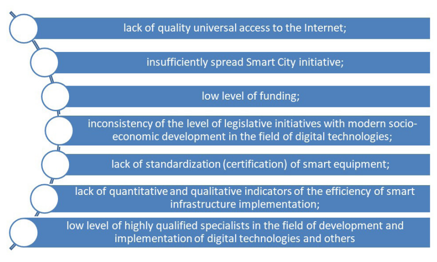
Figure 3: Major problems in the implementation of Smart Cities in Ukraine