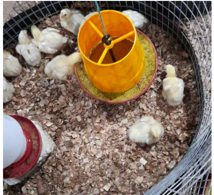
FIGURE 1. Experimental Unit observation, T3 (replication 3)

To obtain this raw material, fresh leaves of M. oleifera were placed into the trays of a food dehydrator ("Ronco ® EZ-Store 5 trays, USA), and were left there for a period of 6 h at 71°C, obtaining a 32,2% Partially Dry