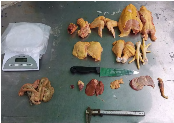
FIGURE 3. Cutting of the carcass and separation of the viscera

Data were obtained individually from each of the organs and were processed as in the previous variables above. (FIG. 3).