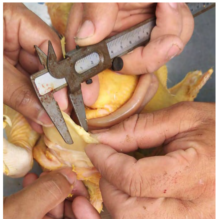
FIGURE 2. Caliper application on abdominal fat

Heart (%), Liver (%), Gizzard (%), Spleen (%), Intestine (%) and Gizzard Fat (%)