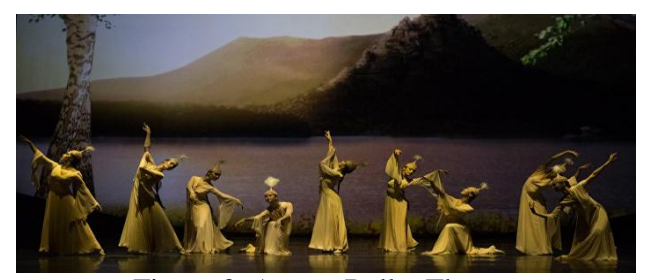
Figure 3. Astana Ballet Theatre

Kazakhstan. There is a force, which can create some new miracles if it is properly transformed into a modern ballet by the choreographer. It seems to me that the future is very serious for the Kazakhstan ballet. (retrieved from the interview for NUR KZ.).