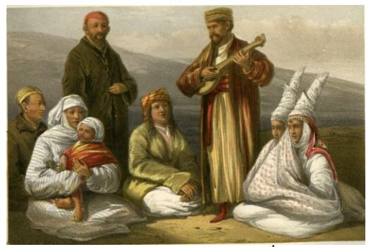
Figure 1. Kazakh aul, the 19<sup>th</sup> century

Kazakh dance art needs an objective assessment of the past and present. The mid-19th-century researcher, Fimenov, said that we not only can but should, by all means, strive to preserve those monuments of folk art that have not yet been lost and still remain in circulation.