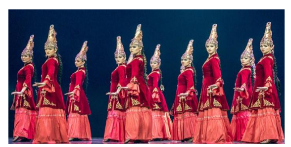
Figure 6. Theater Astana Ballet

performance manner, colorful drawings, and moderate eurhythmy make the audience think about the dignity of Kazakh women, their identity and inner psychology. Asem-Konyr is a eurhythmic ode of the unique history of the Kazakh people conveyed through a female image.