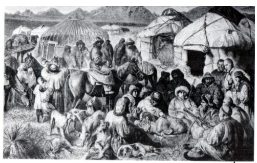
Figure 2. Kazakh aul in the prairie, the 19<sup>th</sup> century

The current stage of national choreography development is determined by the performance analysis of choreographic groups at various performance venues. It is characterized by a high professional, aesthetic and substantial level. This means that the new generation of Kazakh choreographers and maitres de ballet seeks to understand their historical roots and stage impersonation of traditional intellectual culture. This is evidenced by the choreographic works, performances, ballet performances, as well as choreographic paintings that can be seen at large-scale cultural events.