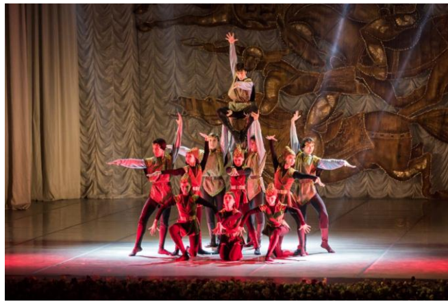
Figure 8. Choreographic performance Er Turan to the music of the folklore-ethnographic ensemble Turan